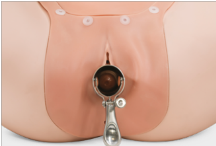
Train vaginal examination and visual recognition of normal and abnormal cervixes