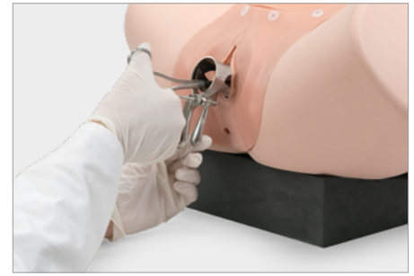
Practice use of tenaculum and Pap test procedure for cervical screening