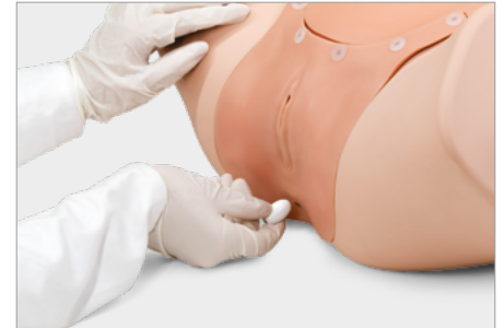
Suppository administration in the patent rectum