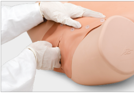
Perform bimanual examinations with palpable, realistic, normal and abnormal uteri

Using the new Gynecologic Skills Trainer P91 will provide invaluable experience on various gynecologic procedures: