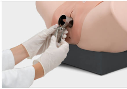
Perform vaginal examination with speculum